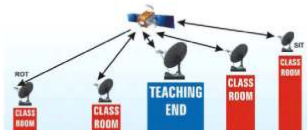
fp=-1 % , Mq s/ uš/odZ

i dZjk"V fr , - ih- ts vCny dyke dks cPpka l s ckr djuk cgr vPNk yxrk gā yskkaeahk MKW dyke l sfeyusdk mRI kg nškk tkrk gā yšdu ; fn vki mul skr djuk pgrs gā rks nšk dsfdl h Hkh dks sea cBdj , Mq s/ ds tfj, ckr dj l drsgā D; kaid gj fdl h dspgrs MKW , - ih- ts vCny dyke nšk dh , tōpskuy l s/sykbv l sl h/ksrkš ij tM+l drsgā bl ds vrxž MKW dyke vc nšk dsfdl h Hkh dks sea cBdj ohfM; ks dkuYā dj l drsgā dlnh; f'k{k.k rdudh l l Fkku ¼ hvkbbV/h¼ , ul hbz/kjVh] ubz fnYyh }kjk MKW dyke dks^, Mq s/* dk , d feuh&gc mi yC/k dj; k x; k gā bl dsek/; e l sog nšk ds fdl h Hkh dks l sykska l skr dj l drsgā